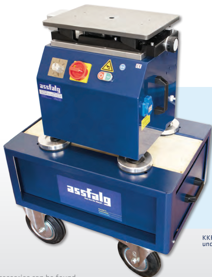
KKF 4-SL with undercarriage

Further accessories can be found in our Accessory Catalogue .