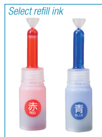
Select refill ink