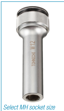
Select MH socket size

Setting torque can be operated by an attached hex key to avoid torque change by human mistake. The set torque is visible via a small scale window in the handle. The torque adjustment hex key is a standard accessory.