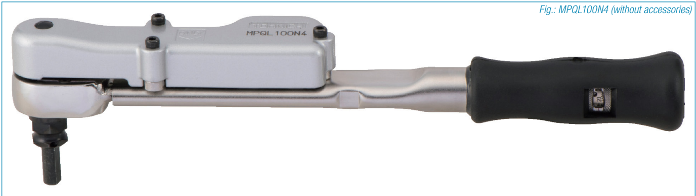
Fig.: MPQL100N4 (without accessories)