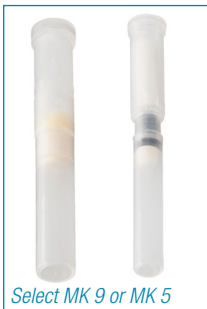
Select MK 9 or MK 5