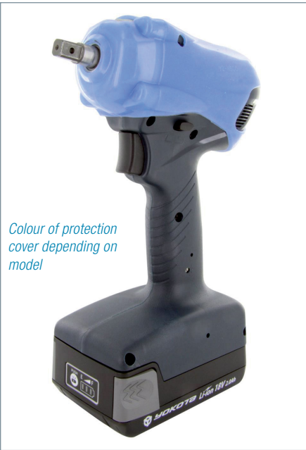
Colour of protection cover depending on model

Yokota YZ-N battery impulse wrenches are powerful, very accurate and most important, have no kick-back. The very compact design offers great accessibility to the joint.