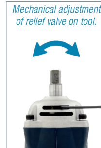
Mechanical adjustment of relief valve on tool.