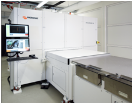
microSHAPE™ can be equipped with a semi-automatic breaking table for glass

The microSHAPE™ platform is based on a gantry design that can easily be configured in dynamics, metrology, handling as well as laser and beam delivery components. The system can be scaled in size and accuracy according to the process' requirements.