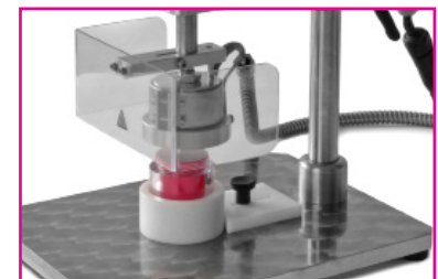
cosmetic jar with container holder (special equipment)