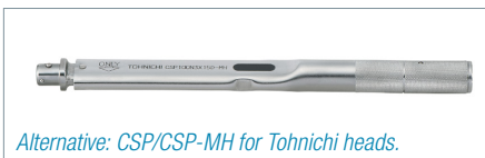
Alternative: CSP/CSP-MH for Tohnichi heads.

Torque presetting can be ordered ex works. If required, please specify your order, e.g. QSP100N4 X 50Nm