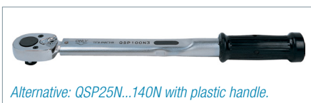
Alternative: QSP25N...140N with plastic handle.