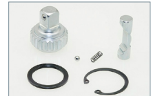
Ratchet Renewal Kit available for all sizes (1/4" up to 3/4").

Option: Quick and easy "Knurl Grip Conversion Kit" available for previous neoprene rubber grip models up to 250 lbf-ft (340 Nm). INFO