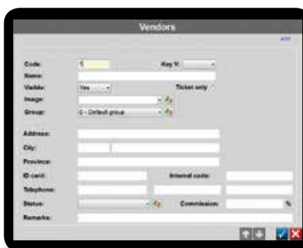
Staff management. New vendors registration.

Note: The purchase of software licenses allows the update to new versions in the Dibal website.