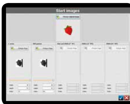
Articles and advertising images management. Association of an image to an article.