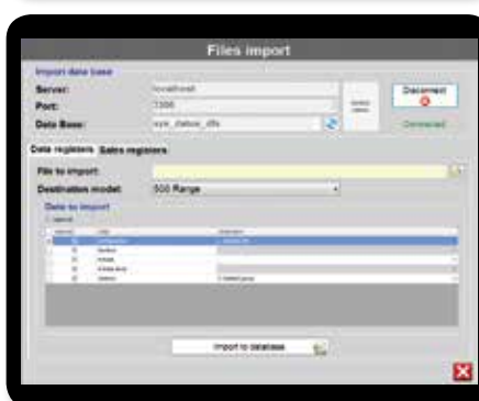
Sales management. Sales data files import to a database for later management.