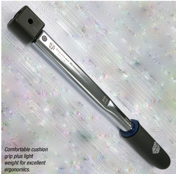
Comfortable cushion grip plus light weight for excellent ergonomics.