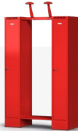
Dimensions HxWxD in cm (without helmet holder)