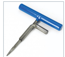
The 'CART' is a specialty tool used to set the torque for all SR preset torque wrenches (P/N 819117).

Option: Can be ordered preset from factory, or you can adjust the torque on your own torque tester ('CART' needed).