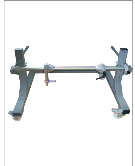
Fig. 5 TROMTRAK 1250 with adjustable driving pin