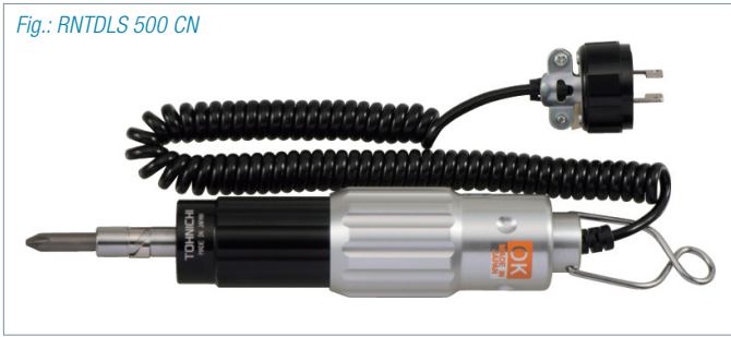
Fig.: RNTDLS 500 CN