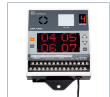
Option: count checker CNA-4mk3.