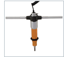
Option: Aux. tightening tool for model 500cN.

Mentioned products are compliant with calibration procedures of EN ISO 6789 type II class E.