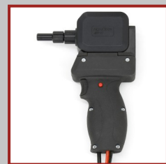
Very small and lightweight jetting pistol