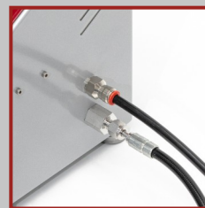
Compressed air and CO2 supply connections