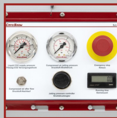
Clear-cut control panel