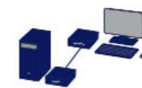
point to point