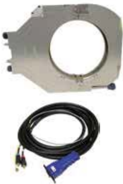
Dimensions table for OSK SW and GW enclosed orbital weld heads

The OSK GW and SW handle and cable assemblies and weld heads are compatible with one another!