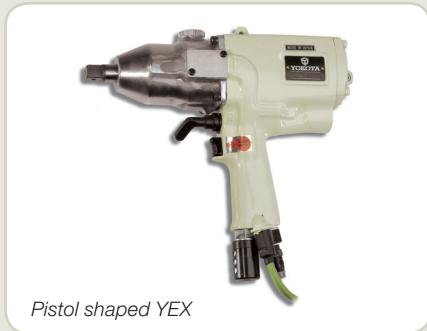
Pistol shaped YEX