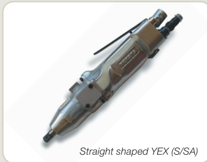
Straight shaped YEX (S/SA)