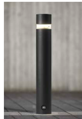
Bollard 057 also available as a lighting bollard (see p. 072: Lighting Bollard 230 LED )