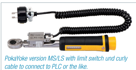
PokaYoke version MS/LS with limit switch und curly cable to connect to PLC or the like.