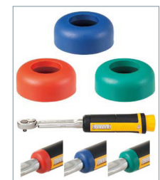
Optional color caps available separately.