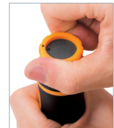
newly developed lock mechanism.

Via optional color caps differently set wrenches can be identified at a glance.