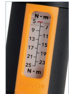
Large easy-to-read scale for as simple as precise torque adjustment.