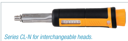
Series CL-N for interchangeable heads.