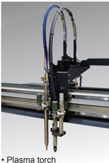
• Plasma torch