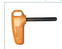
Adjustment tool No. 931 for CMQSP-M6; No. 930 for M8-M12.