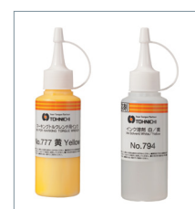
Ink and solvent are packaged and sold separately.