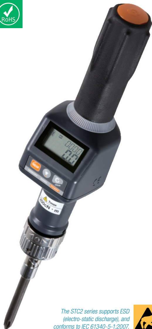
The STC2 series supports ESD (electro-static discharge), and conforms to IEC 61340-5-1:2007.