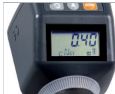
LED indicator guides user towards target torque and warns of over torque in tightening mode.