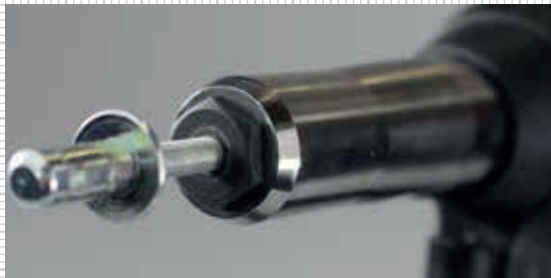
Eminently suitable for FERRO® BULB blind rivets!