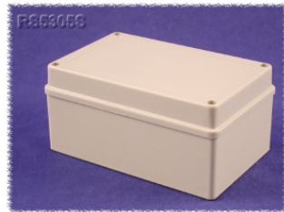
Assembled View (Top)