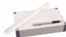
Protective covering on aluminum is perfect as