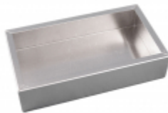
Standard version shown inside and out.