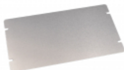
Optional bottom panels available for all sizes.