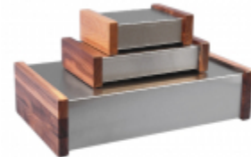
Six sizes available with walnut sides.