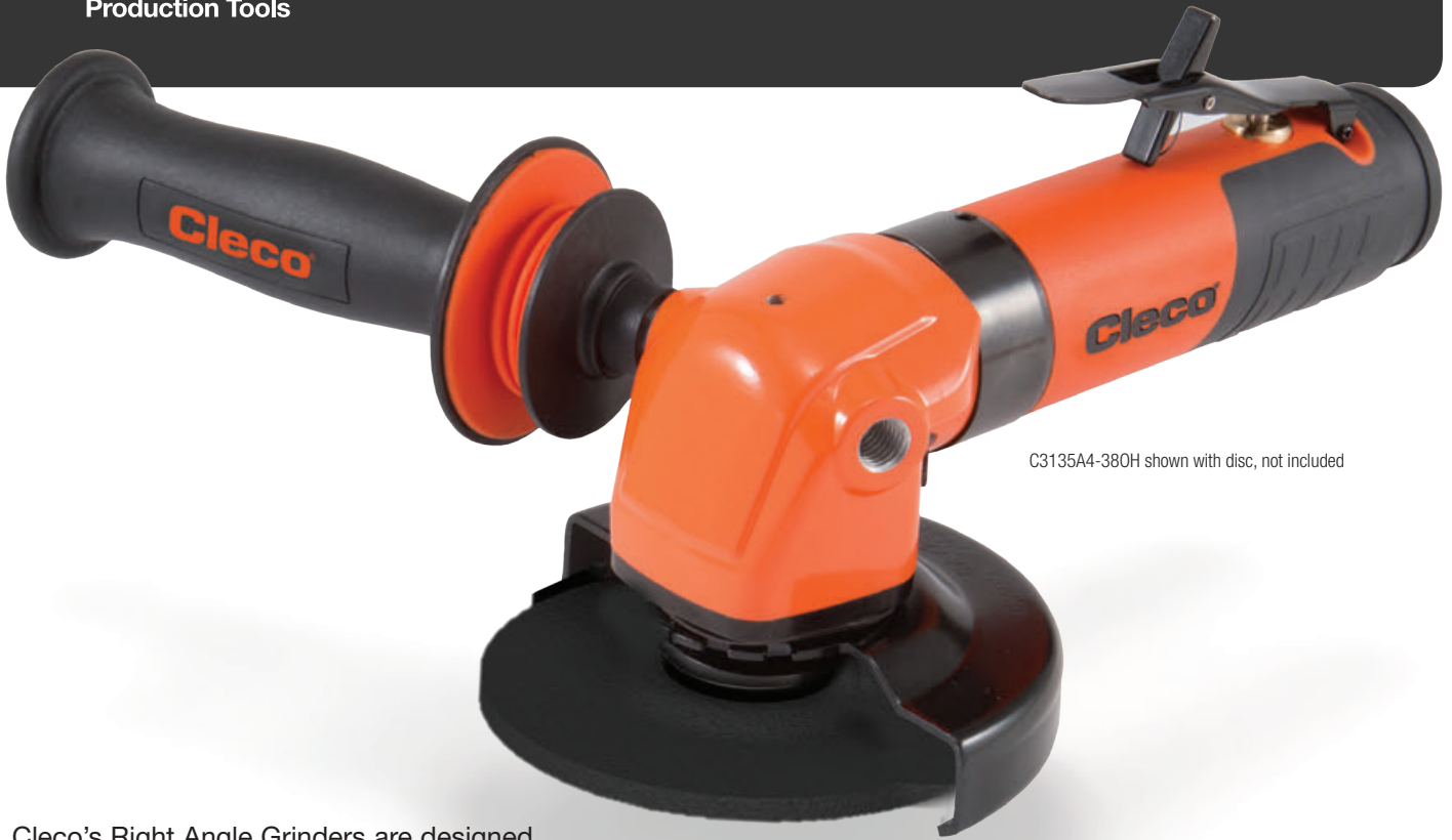
C3135A4-380H shown with disc, not included

Cleco's Right Angle Grinders are designed for rigorous use and long life, containing the features and power that are perfect for the most demanding applications found in foundries, shipyards, machine shops and rail car manufacturing.