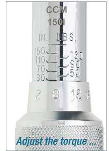
Adjust the torque ...