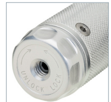
... and lock securely.

Formerly version with neoprene handle optionally convertible to metal grip. Ask for your "Knurl Grip Kit".