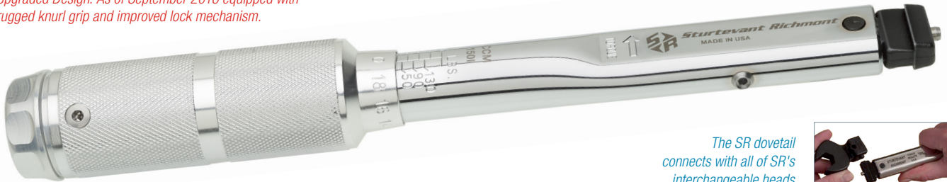
The SR dovetail connects with all of SR's interchangeable heads

Upgraded Design: As of September 2016 equipped with rugged knurl grip and improved lock mechanism.