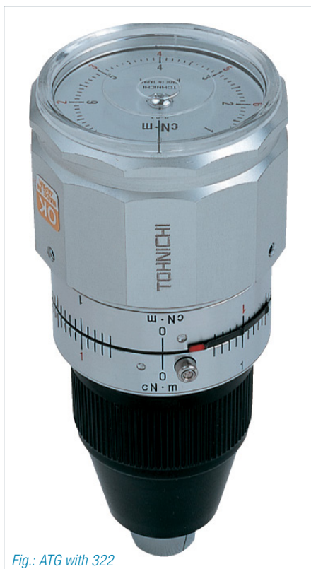
Fig.: ATG with 322