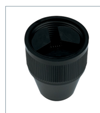
Resin Chuck #322

ATG models have a three-jaw chuck which firmly grasp the object. Main body and chuck are locked when pushing "push lock button". Push lock button makes body and chuck secured while using chuck.