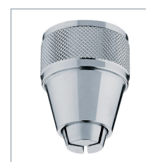
Steel Chuck #321