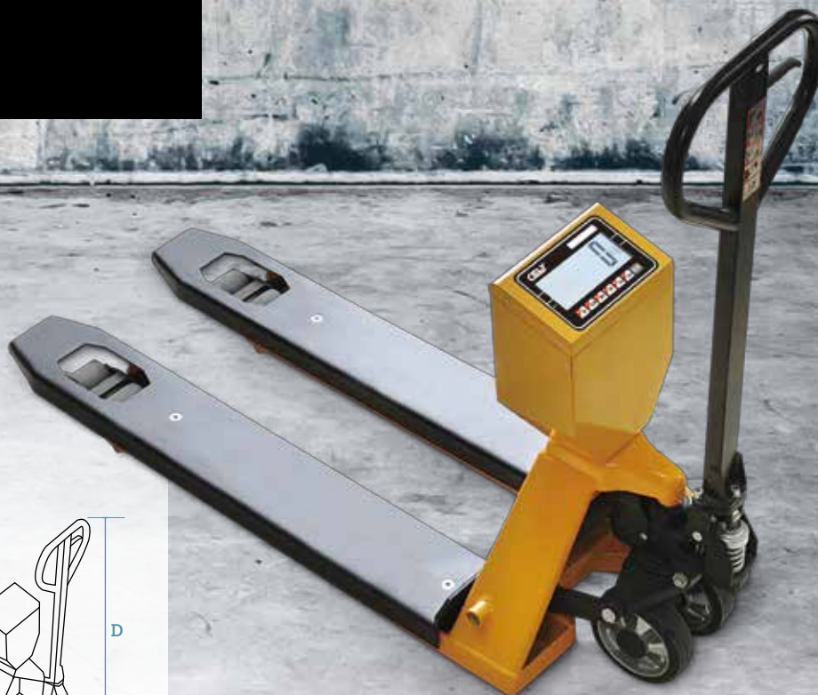
Dimensions DATA IN mm