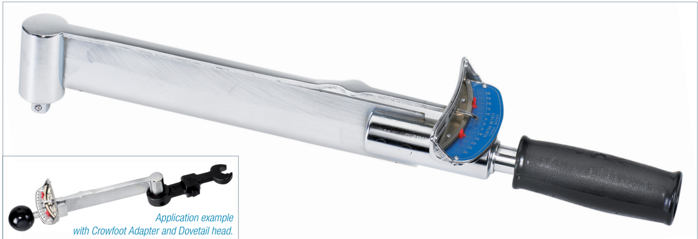
Application example with Crowfoot Adapter and Dovetail head.