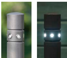
Bollard 008 also available as a lighting bollard (see p. 073: Lighting Bollard 240 LED)

Powder coating in standard RAL colours or DB 703