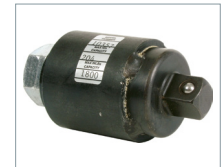
Optional: Rundown Fixtures (RDF) up to 340 Nm.