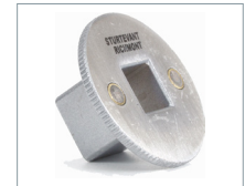
Optional: Square Adapters in misc sizes.