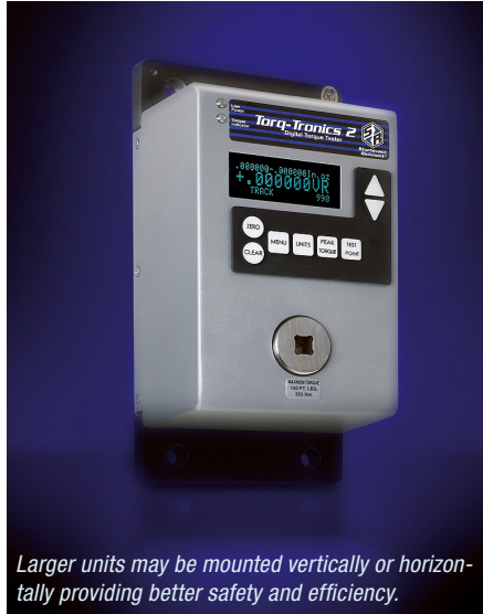
Larger units may be mounted vertically or horizontally providing better safety and efficiency.